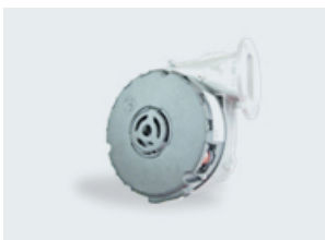
EDM BLDC variable-speed fan