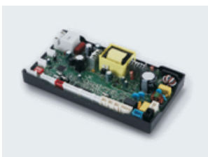
Electronic thermostatic PCB