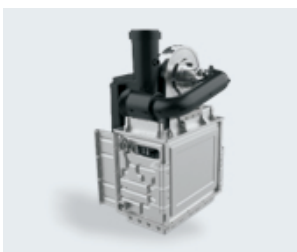
Lead-free 304 Stainless steel heat exchanger